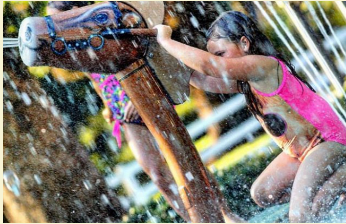
Splash Pads & City Pools